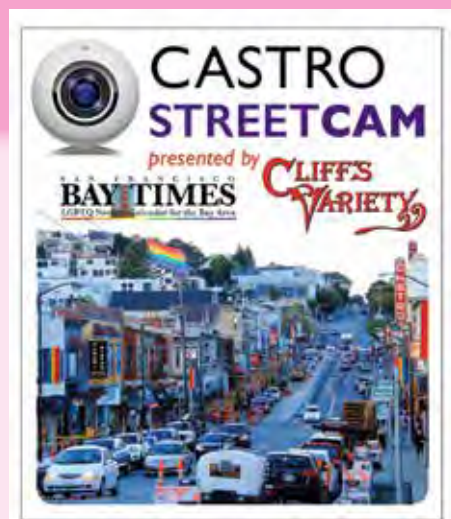
San Francisco Bay Times Castro Street Cam

The San Francisco Bay Times for years has ranked either first or second for engagement at Facebook among all comparable LGBT media companies in the U.S. Engagement in 2020 frequently went over 181K, ranking the Bay Times over 5 times higher than the second listed company. Since our social media offerings are tied to the Bay Times website, content and advertising at the site are boosted.