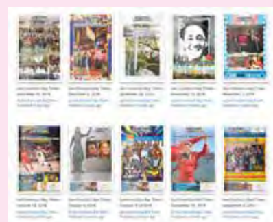
Full text of current and past issues is at: https://issuu.com/sfbt