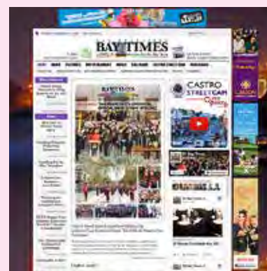
Homepage of https://sfbaytimes.com/