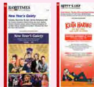
Bay Times List and Betty's List E-blasts